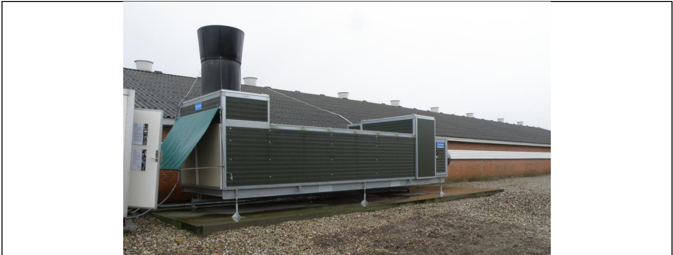
Figure 1. Picture of the Agro Clima Unit situated outside the test broiler section. Ventilation air to and from the broiler house are drawn through the Agro Clima Unit by a counter current principle to utilise the heat content of ventilation air to heat up inflowing air.